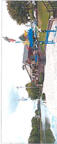
Harvester Park (D)