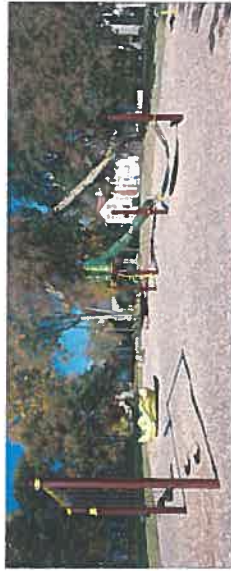
South Avenue Park (H)