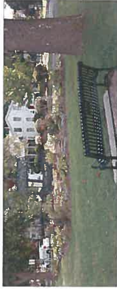
Remembrance Park (F)