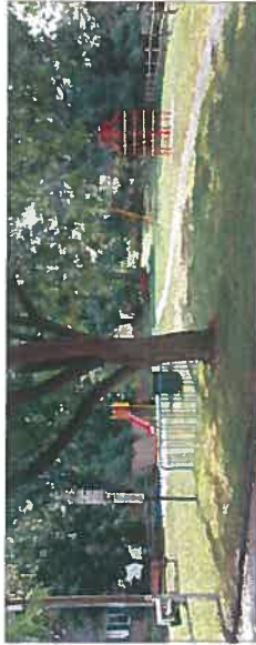
Evergreen Park (C)