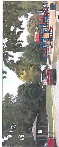
Monika Andrews Children's Park (I)

For more information about each park, please go to: http://www.brockportny.org/community/village-parks