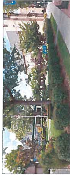
Sagawa Park (G)