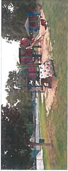
Barry Street Park (A)