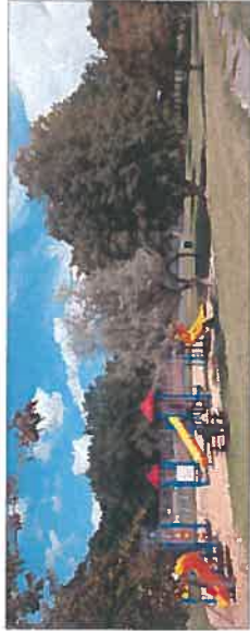
Corbett Park (B)