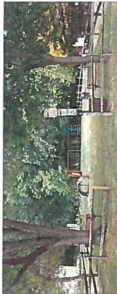
Havenwood Park (E)