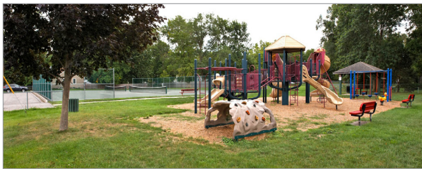
Barry Street Park (A)