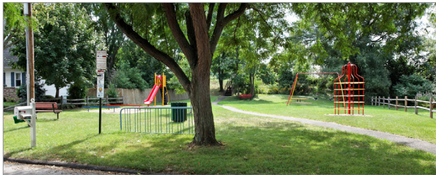
Evergreen Park (C)