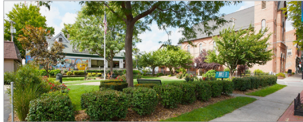
Sagawa Park (G)