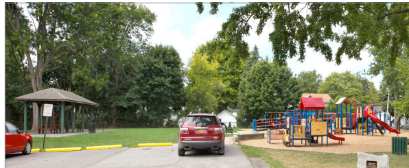
Monika Andrews Children's Park (I)