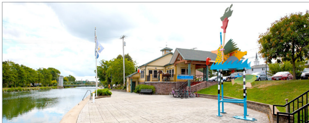
Harvester Park (D)