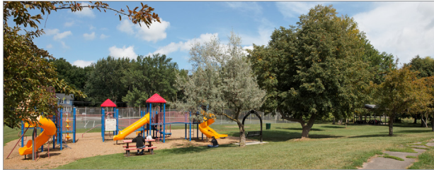
Corbett Park (B)