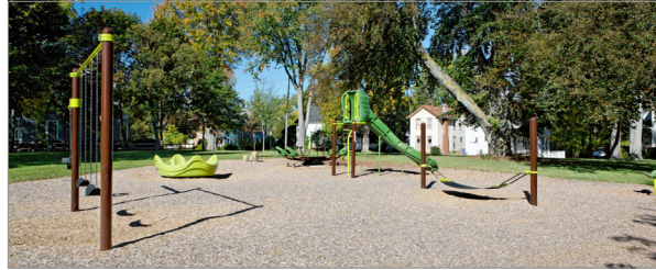
South Avenue Park (H)