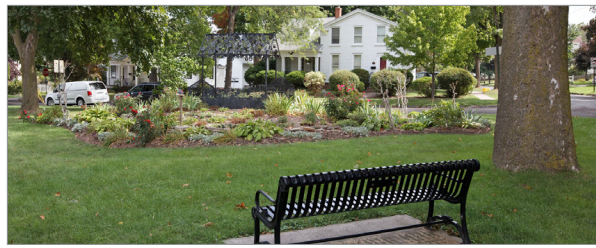
Remembrance Park (F)